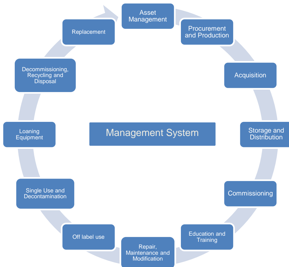
Figure 1: Management Process

2.1 Ensuring there is an effective management system in place for medical devices and equipment is critical to the provision of healthcare. Health technology, medical devices and equipment are vital for the delivery of a range of services covering diagnosis, therapy, monitoring and rehabilitation. They must be procured, managed and maintained appropriately in order to provide high quality patient care. Additionally, they must meet clinical, financial and information governance requirements to minimise the risk of adverse incidents/events occurring. Failure to manage health technology, medical devices and equipment proactively can be a significant risk to organisations and can lead to the same types of adverse incidents/events occurring repeatedly. Management systems in place must cover product recalls, adverse incidents/events and near misses as part of the overall proactive medical equipment management strategy required to minimise repeated occurrences.