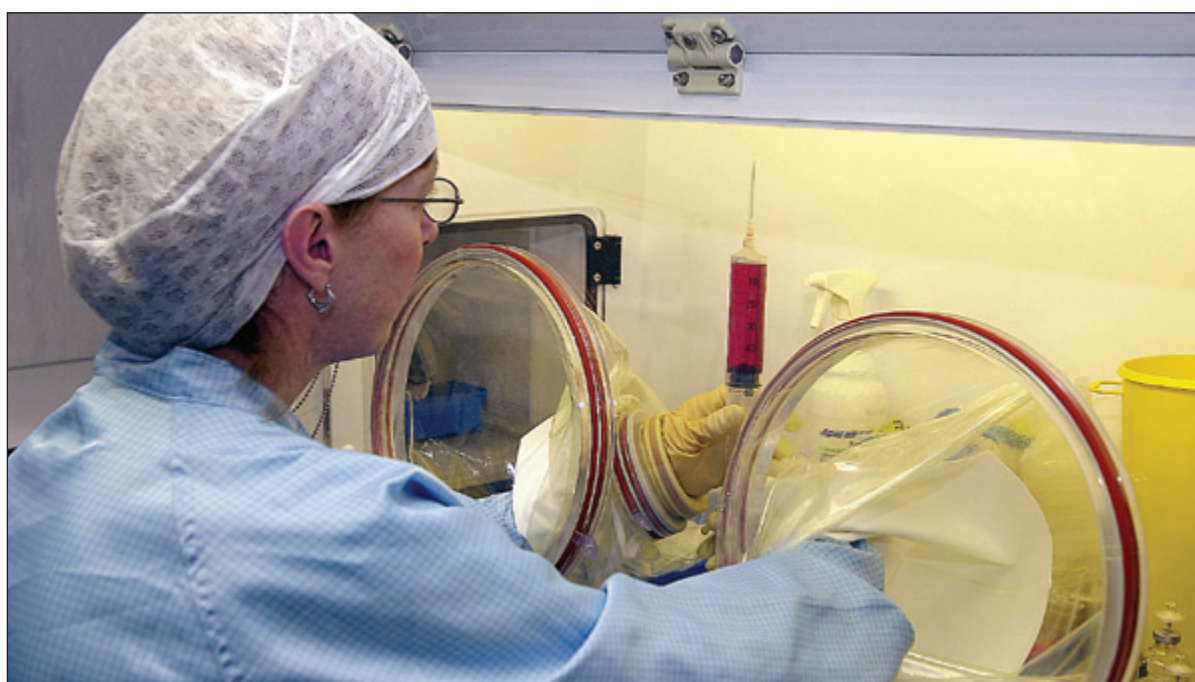
Isolator clean room