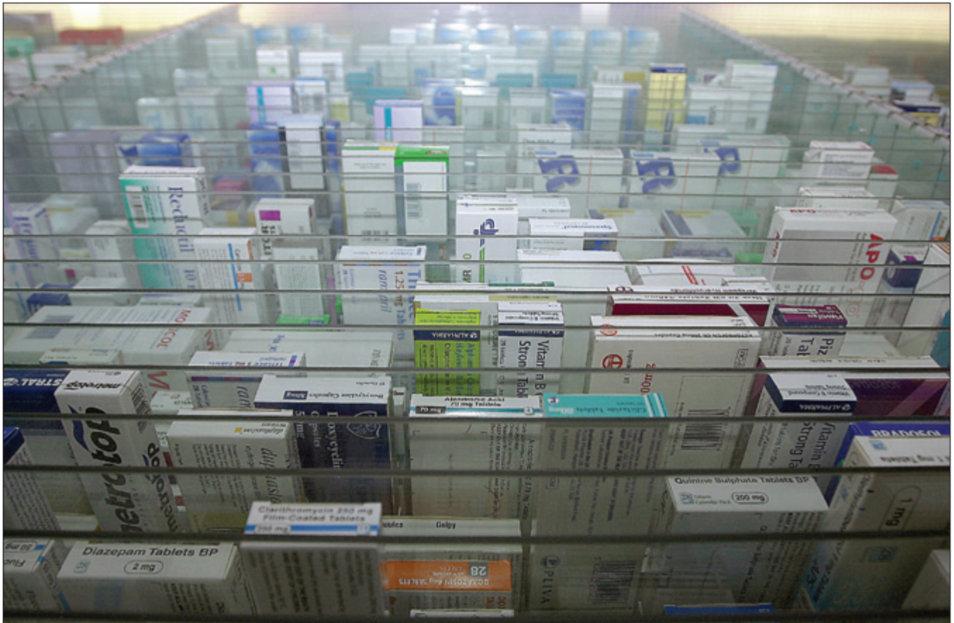
Medicines storage for use with dispensing robot