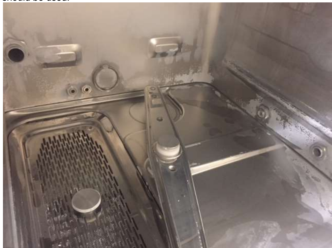
Figure 2: An example of lime scale build up within a washer disinfector

5.27 Where the local water supply is >125 mgl<sup>-1</sup> of CaCO<sub>3</sub> a water softening system should be used.