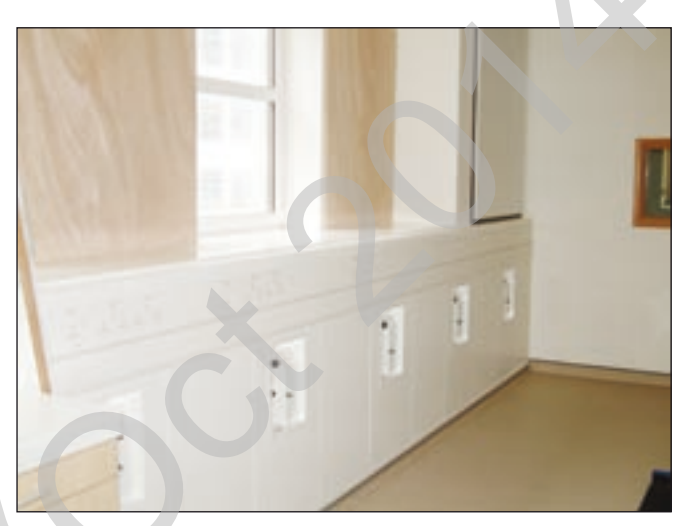
The technical services area should have a treated water supply and drainage facilities

4.97 A separate equipment storeroom will be needed to store spare and isolated dialysis machines. (The maintenance room itself should not be used to store any spare machines.) A treated water supply, power and drainage facilities are required.