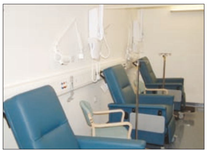
PD training room with worktop and clinical wash-hand facilities