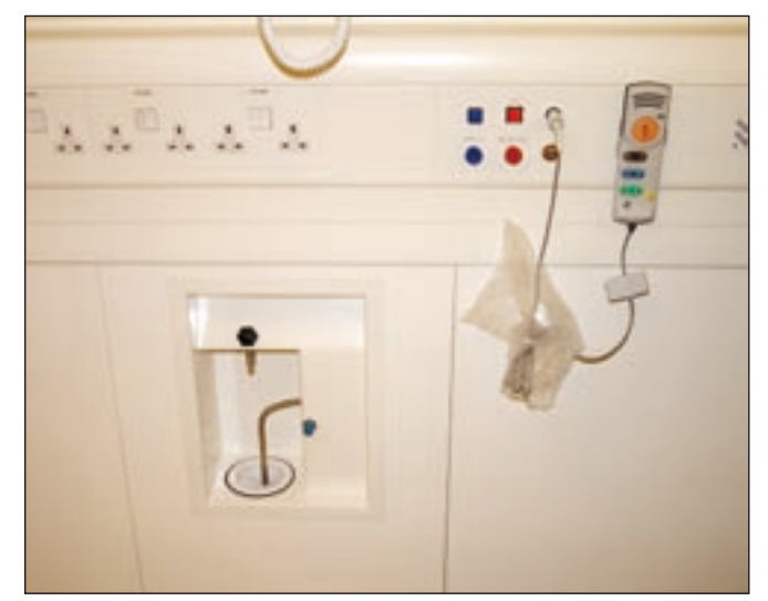
Each bedhead should have outlets for medical gases and vacuum, and (where required) be plumbed for dialysis-standard water, and have drainage outlet points