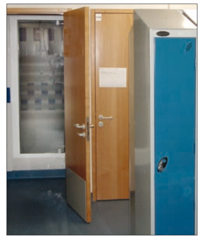
Personal full-length lockers and separate male and female showers should be provided en-suite in the staff change/locker room