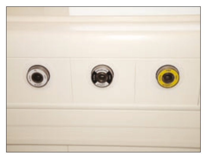
At each location within a bedhead trunking system, oxygen and vacuum services will normally be required