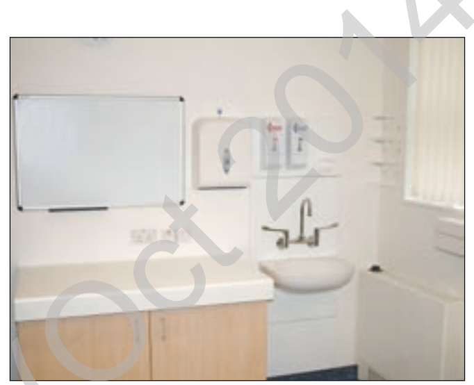
PD training room with worktop and clinical wash-hand facilities

5.7 This room is used to teach patients how to perform their own peritoneal dialysis safely and adequately, and to provide advice and education for patients and their families, enabling them to make best use