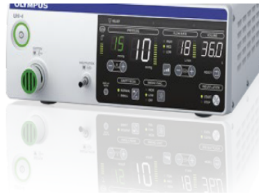
HIGH FLOW INSUFFLATION UNIT - UHI-4

Olympus has become aware of patients experiencing complications from over insufflation, including arrhythmias reported as “short cardiac arrests”, gas embolism, and one death, during surgical procedures where UHI-4s were used.