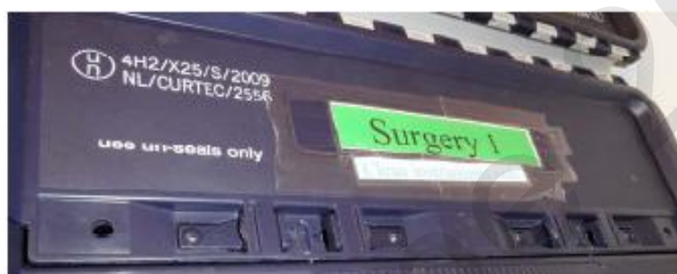
Figure 5: Packaging showing clear label