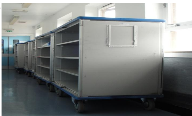
Figure 4: example of LP621 Transportation Cart.