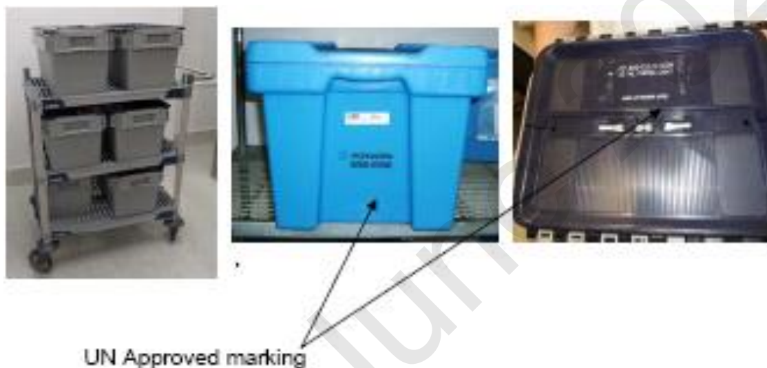
Figure 3: Examples of P621 individual packaging showing location of UN approved marking.